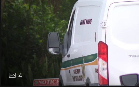
One teen dead in drowning near Gulfstream Park, mother and sibling rescued