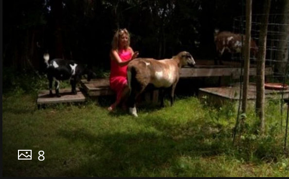
NEW PSL Secret Gardens: Residents want County Commission to vote no on Walton Ranch